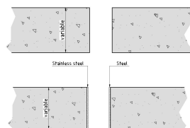
Sealing system for concrete joint